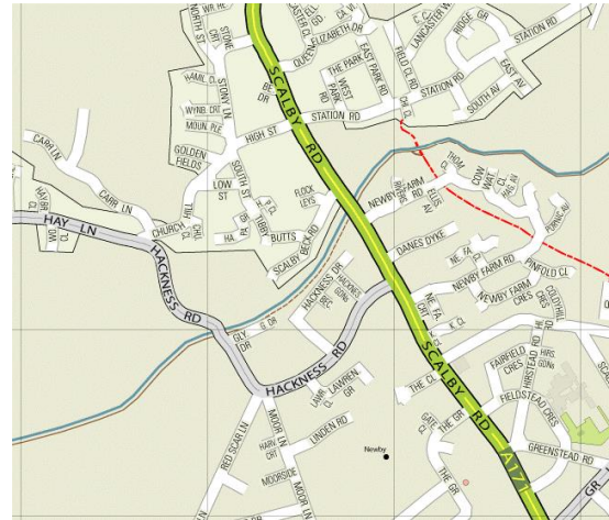
Aerial map of Scalby village