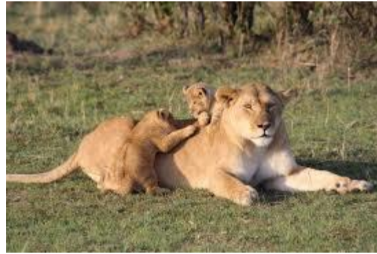
Lion and cubs