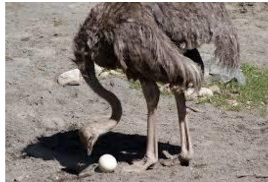
Ostrich and eggs